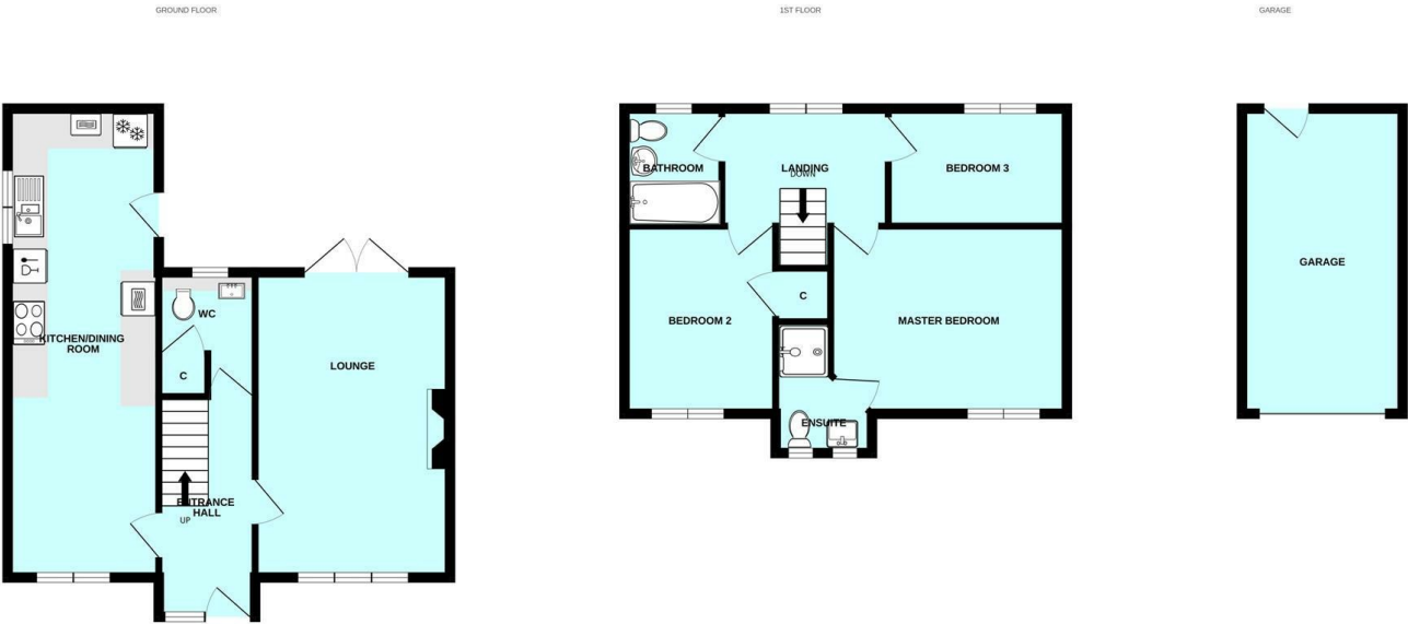
Made with Metropix ©2025

Please contact our Plymouth Office on 01752 664125 if you wish to arrange a viewing appointment for this property or require further information.